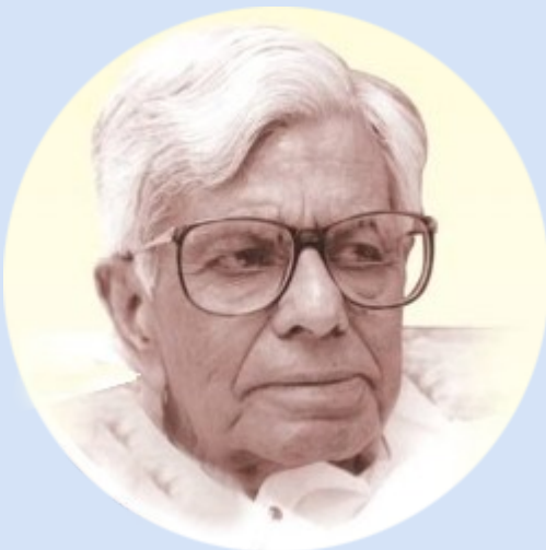
By Shri C. Subramaniam Philosopher Statesman Philanthropist Former Governor (Maharashtra)

Former Union Cabinet Minister Bharathrathna recipient